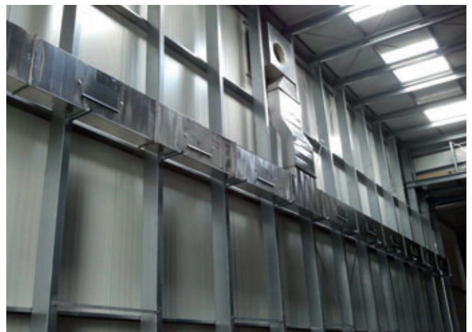
The stainless steel construction with an insulated housing guarantees a long service life, operational reliability and a constant high performance.