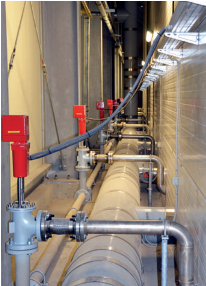
Piping gangway on the rear side of the slab rack with vapour pipe, a valve for each curing chamber and the air distribution pipe.

ation with Kraft: "The products that we manufacture on the hermetic press in our modern Schindler plant are mostly large, thin slabs that are subjected to various surface treatments. In order to enable this it is necessary to obtain sufficient hardness of the concrete as quickly as possible. We found that we could only achieve this in an isolated curing environment with closed chambers and the use of modern technology for heating and air circulation - with the vapour technology supplied by Kraft. Our co-operation with Kraft goes back a long way. Their Quadrix and Vapor systems have been used successfully in our plants for many years now. That's why we relied on the experience and proven solutions from Kraft for the implementation of our latest investment in Tarnow - in other words we relied once again on the Vapor system developed by Kraft."