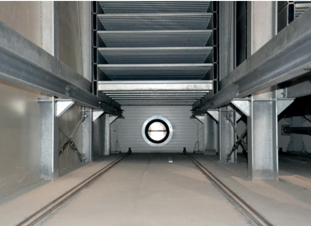
Inlet opening for the hot air under the slab rack.

the case of the Bruk Bet plant in Tarnow, for instance, we designed and dimensioned our curing system to precisely match the products, manufacturing characteristics and mixtures used by Bruk Bet.”