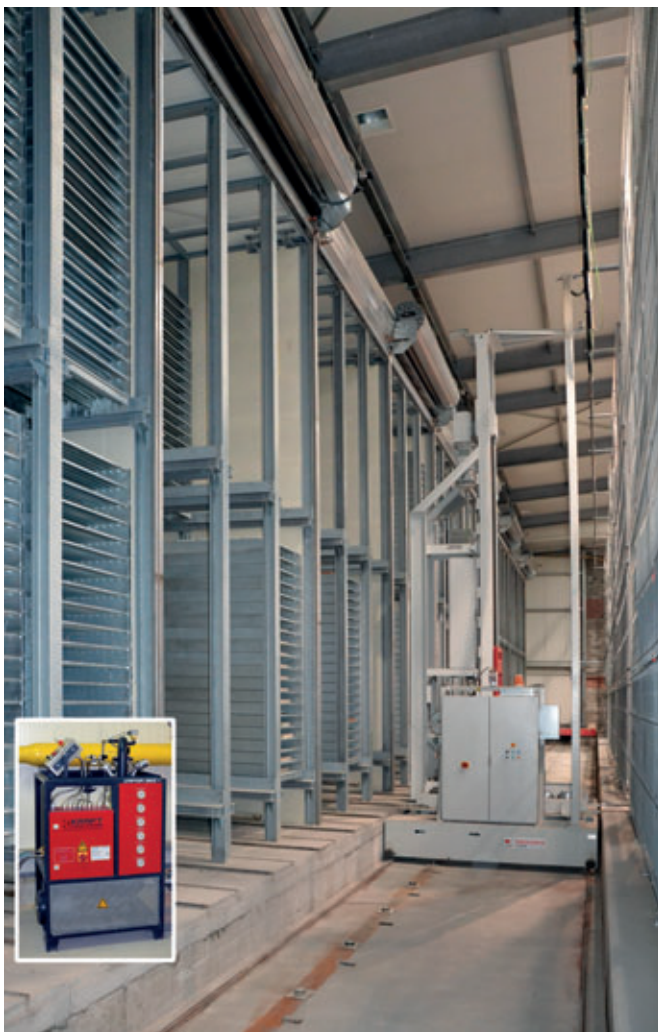
Direct size comparison of the vapour generator and the curing rack (40x8x5m). The operation of such a large plant with the smallest vapour generator from the Kraft product range (footprint only 95 x 77 cm) is possible only through precise adaptation to the customer's production parameters. The result is very high product quality with very low energy costs.

Zbigniew Lechowicz, director at Bruk Bet with responsibility for investments in new technologies for production, tells of his experiences with Kraft plants and co-oper-