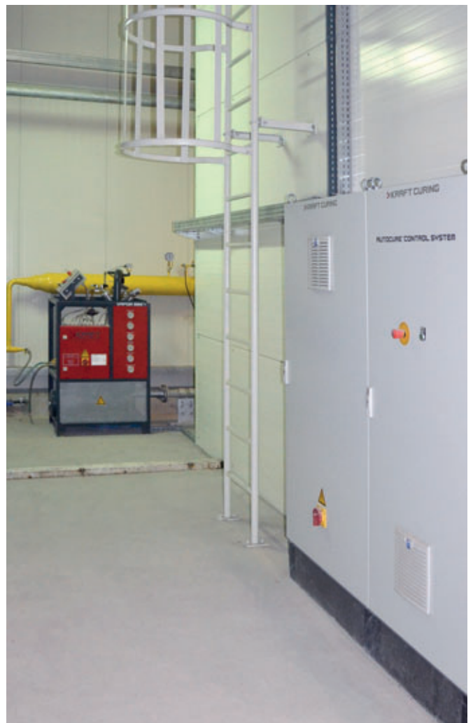
Kraft Vapor Mini™ vapour generator with Kraft Autocure™ controller in the new Bruk Bet footpath slab production plant in Tarnow.