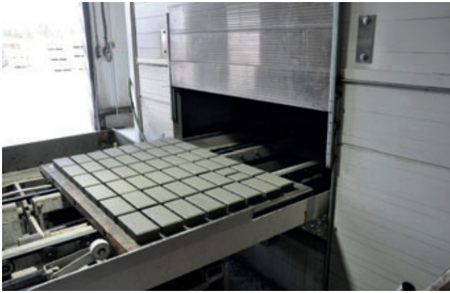
Fresh concrete products pass through a small adjustable opening in the curing chamber wall within 30 seconds of being produced – eliminating evaporation of moisture from the concrete. "Our machine operators say: the edges are now perfect!"