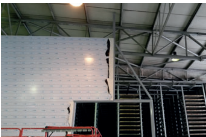
Installation of steel frame and insulation panels for insulation wall between the production and curing areas.

CITYSTONEDESIGN® www.citystone-design.com