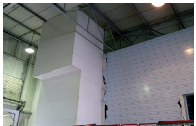
Installation of insulation panels around the elevator prior to completion of trim work. The insulation of the wall requires a total of 5 working days.