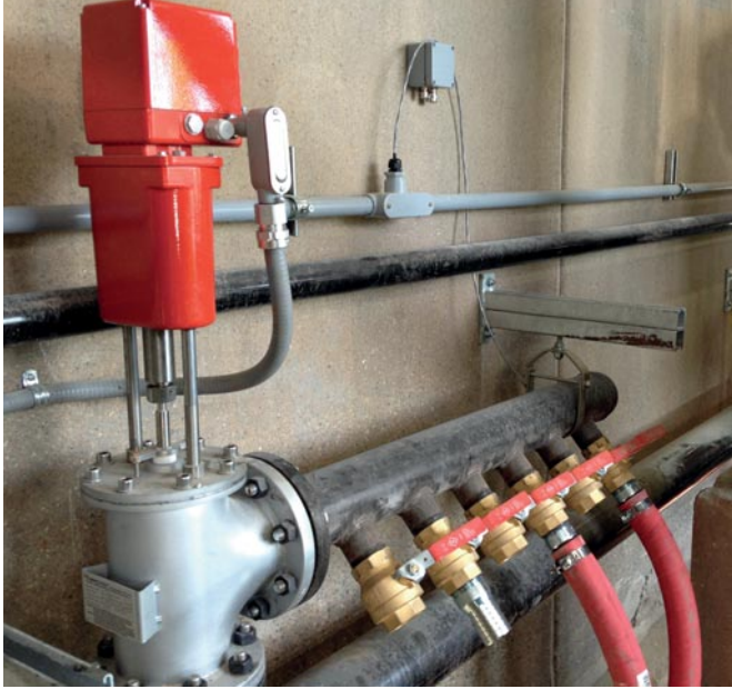
Vapor control valve with hose connections to inject vapor underneath the molds.