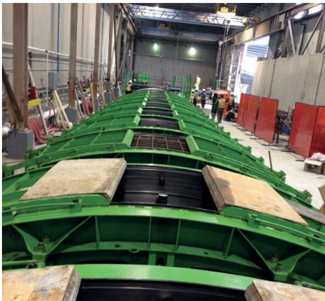
Evergreen Mold Segments cleaned and ready to pour concrete, molds are poured twice a day producing 48 segments a day which equals 6 tunnel rings.