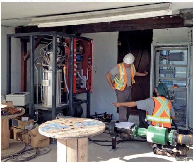
KC 20-1S Vapor Generator - Compact but powerful vapor system during installation