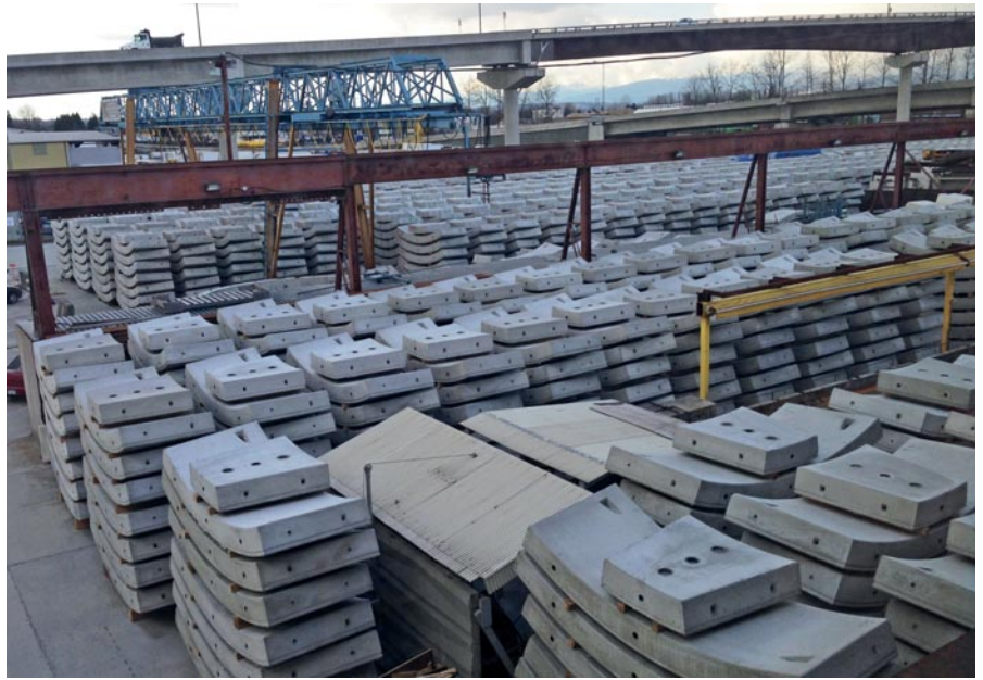
APS' Langley yard shows some of the 3504 segments/438 rings poured to date.

unique features that allow for APS to keep a solid, consistent pace during production. The custom solution created by Kraft allows the large tunnel segments to be vapor cured in stationary molds. The molds are covered by an insulated tarp that is tightly sealed. The forms are cured with vapor via an automatic valve and hoses. The temperature of the concrete is closely monitored with internal temperature measurement. The vapor provides the heat and moisture required for proper curing. All curing data (e.g. time, temperature, humidity, batch number and mold station) is sent to the VaporWare system that records this data for quality control and for the inspectors. This way, the segments are cured to the specifications of the project and in the most energy efficient way possible. After initial concrete set, the segments are heated to 50°C and 100% humidity so that the product can be demolded and transported within four hours, allowing for double pours per shift and greater mold utilization. For the second pour of the day, the curing temperature is reduced to 25°C to allow for 12 hour curing. Kraft went on to say, "Changing the temperature or conditions a very tiny amount can significantly affect the way concrete cures. And, efficient curing isn't just a benefit to the concrete, it also saves a substantial amount of money."